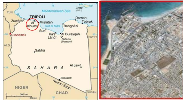
Figure 1: Location of Al-Khoms city in Libya

of Libyan culture and arts. Therefore, it portrays the development in the architectural and urban identity of Libya.