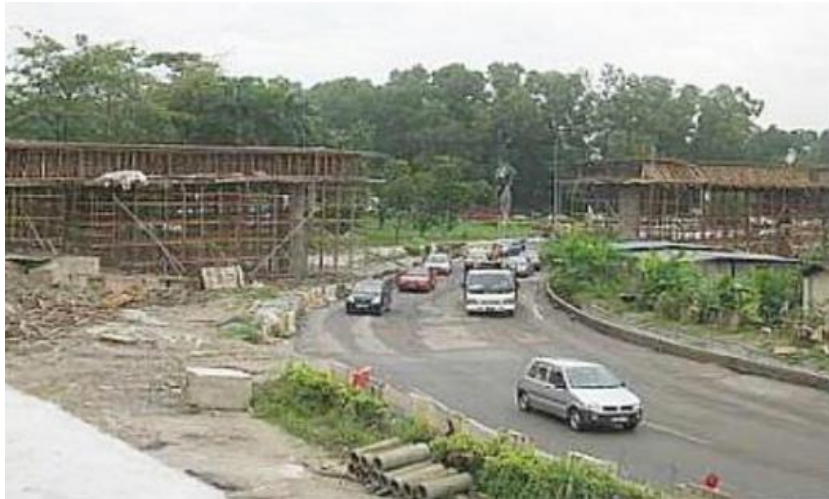
Figure 1.1: Construction of flyover and road upgrade at the junction of the Bukit Jalil Highway and the Serdang Raya main road.

The construction of a flyover and road upgrade at the junction of the Bukit Jalil Highway and the Serdang Raya main road, the project which started in December 2006 was halted in July 2007 because of land issues and was stopped again in March the following year as the contractor had claimed that the flyover design by PWD was incomplete.