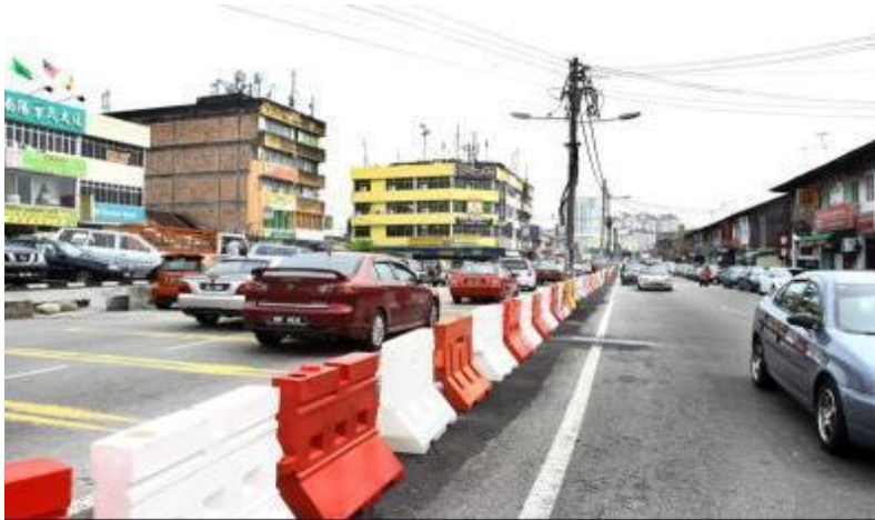
Figure 1.2: One-way street in Serdang in limbo.

Identifying some of the causes and factors of delays and disruption usually the first stage when addressing the problem and then a corrective measure would be taken, hence it is very essential that the researcher will diagnose some of the main causes, factors and effects of delays and disruption. This is because the principle reasons for delays and disruption may diverse at different places (Ogunlana & Prokuntong, 2008). In addition to that, this research will determine the possible way to minimize delays and disruption in construction projects from the perspective of those involved in the construction industry like the clients, the contractors, and the consultants. Based on the findings from the analysis some recommendations that would be aimed at reducing the impacts of delays and disruption caused to the construction industry has been outlined, the study would also clarify and create awareness of the extent to which delays and disruption can affect project delivery.