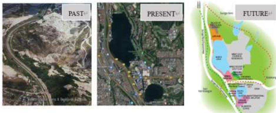
Figure 5: Mines Wellness City Tin Mining Site and The Current State of The Industrial Site After Its Transformation as well as Its Future Development Plans.

The transformation of the Mines Wellness City from a formerly uninhabited tin mining site to an industrial area is a classic example of urban regeneration, it has transformed the city and given it a whole new vision and opportunity to reshape the town and beyond. The tin mining site, which was previously a single tin mining industry, has now transformed to include the Golden Horse Health Reserve, Cultural activity area, a Chinese health centre, a Palace Vacation Club, an environmental education area, and a sports and recreation area. As more and more industrial sites are being transformed into multifunctional landscapes, these projects are not going to just become regular ornamental landscape features. This project is transformed into a complex and neat multifunctional landscape corridor with an artificial lake, a bicycle track, an exhibition hall, a swimming pool, a horse racing arena, an art gallery, a park, a golf course, a mall, as well as surrounding landscape facilities. With the simple transformation of an abandoned industrial site, the area has not just become a simple urban park but a collection of public facilities, landscape facilities, and landscape architecture designated to the community. It has also become a multifunctional landscape that can and will continue to provide more convenience and satisfaction to the citizens.