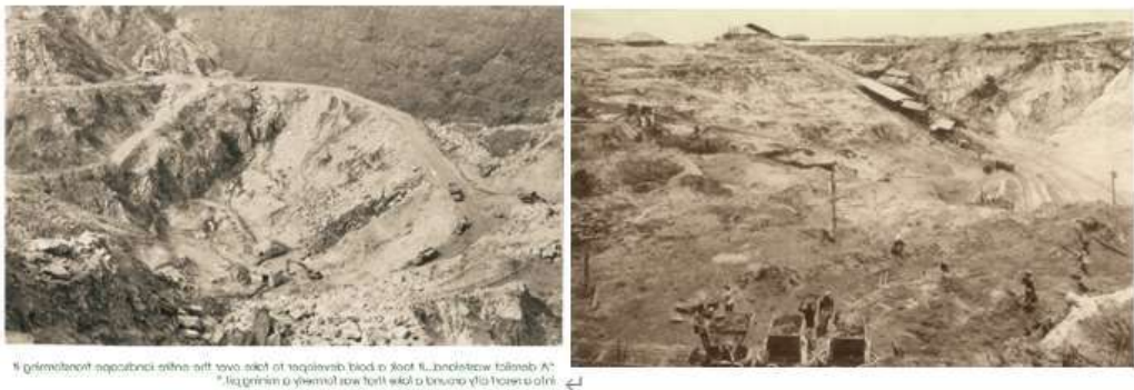
Figure 1: Original Pre-Development Industrial Site of Mines Wellness City (MWC)