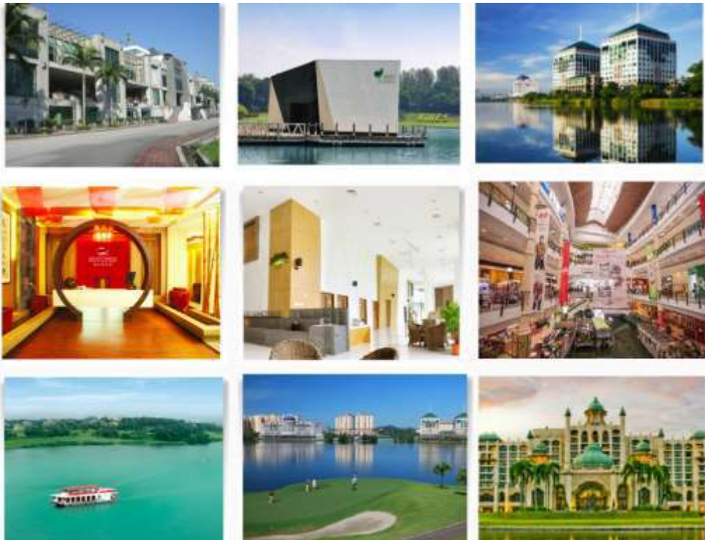
Figure 3: Mines Wellness City Multifunctional Landscape and Urban Regeneration Landscape Images

By 2020, the city is expected to be a RM5.5 billion development, playing a central role in tourism and becoming Malaysia's foremost wellness destination. The city's expansion is part of the government's Economic Transformation Programme (ETP), led by PEMANDU (Performance Management and Delivery Unit) under the Prime Minister's Department. The development of Mines Wellness City will lead and contribute to increased economic activity, employment opportunities as well as gross national income.