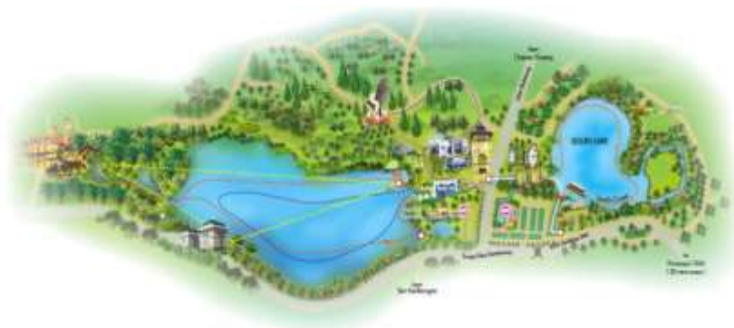
Figure 4: Mines Wellness City Tourist Attraction Route Map

Mines Wellness City is one of the most iconic examples of the adaptive use of an abandoned tin mining site in Malaysia. It is also one of the best examples of post-industrial landscape reclamation. Before becoming a tourist resort area, the area consisted of several open pits caused by the tin mines— an industrial heritage object with a high index of pollution and degradation. According to the design plan of Country Heights Holdings Bhd (CHHB), this project's future development is a long-standing one and it is also a social development necessity.