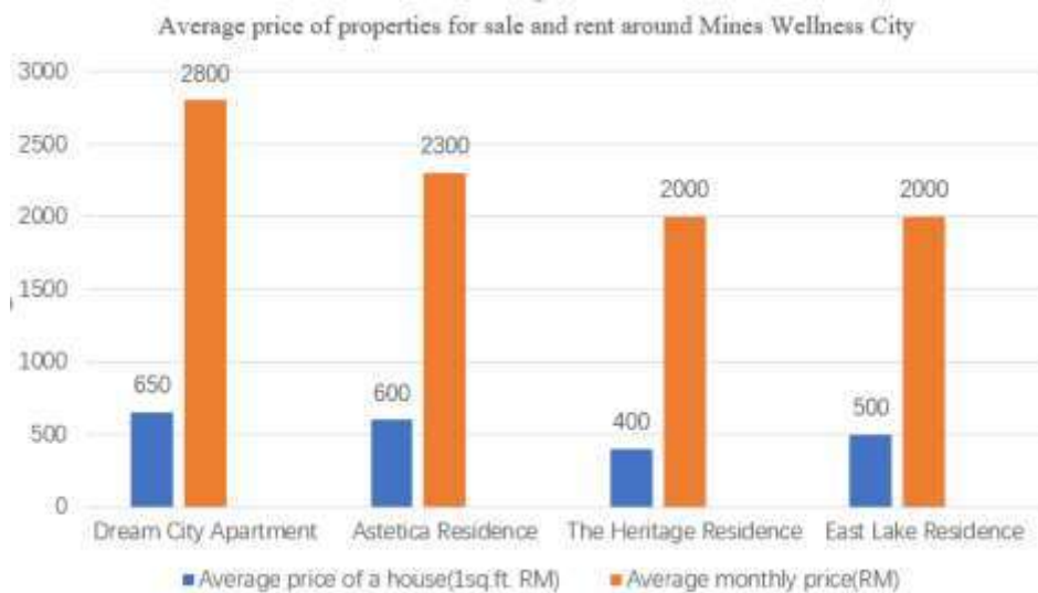
Table 1: Average Selling Price and Average Monthly Rental Fee of Properties Around Mines Wellness City

A questionnaire survey of the residents of Mines Wellness City was carried out, and it was found that the reclamation of the tin mine site and the surrounding landscape had a significant environmental and economic impact on the project. This is reflected in the difference between the landscape with and without the industrial site in the same area. For this reason, we have produced a detailed comparison between the two projects using bar graphs and a pie chart of the economic influences around Mines Wellness City. Mines Wellness City and Equine Park are projects within the same area, the only difference is that Mines Wellness City is an urban regeneration project of an abandoned industrial site dependent on industrial culture, landscape, and values. At the same time, Equine Park is an economical construction project under normal social development. The statistics were obtained from interviews with iProperty Malaysia, a local rental software, and Wikipro, a rental and sales agency.