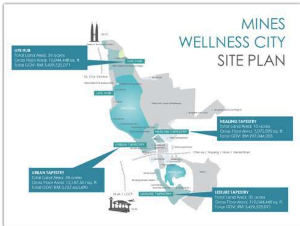
Figure 2: Mines Wellness City (MWC) Development Plan